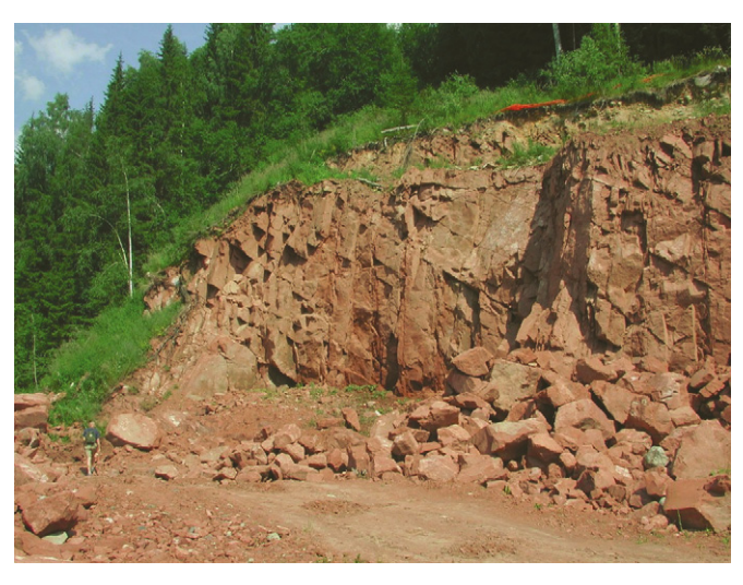
Figure 4 - The Brumunddal sandstone at the quarry close to the Mauset school. The picture gives a general impression of the relatively homogeneous red sandstone, the bedding and the fracture system.