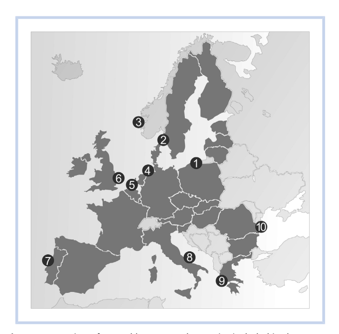
Figure 1. Location of coastal lagoons and estuaries included in the ARCH project, covering the interface between land surface and the seas surrounding Europe (see Table 2 for site names).

A first step in the ARCH project was to connect the various disciplines and to develop an interdisciplinary and integral framework to analyze various case sites and capture the various problems and pressures facing lagoons. The research activities were centered around 10 case study sites (lagoons and estuarine coastal areas, hereafter referred to as lagoons), with a geographical distribution covering all major seas surrounding Europe: the Baltic Sea, Norwegian Sea, North Sea, Atlantic Ocean, Mediterranean Sea, and Black Sea (Figure 1). State-of-the-lagoon (SoL) reports were prepared using this framework for each case study site, an exercise in integrating different disciplines and different fields of expertise. The SoL reports consisted of gathering existing data, integration of data, and presentation in the context of ecosystem services, with an emphasis on minimizing the boundaries between the different scientific disciplines.