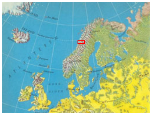
Figure 1: Map with the Rana district marked.

slushflow release, have identified critical water influxes related to different snowpack conditions and weather (Hestnes and Bakkehøi 1995, 2004). The project started late in 1991 in the Rana district of Norway, see figure 1.