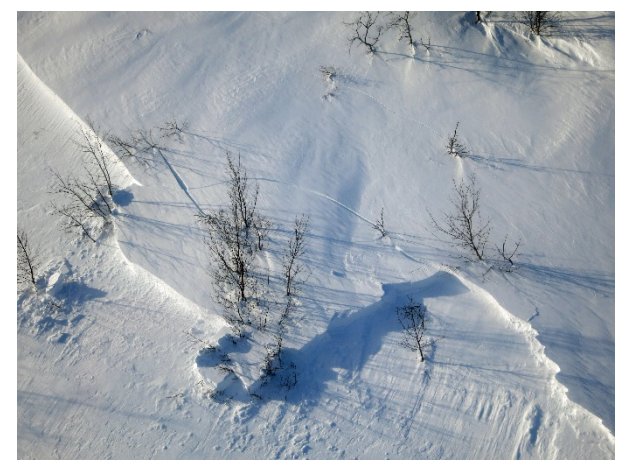
Fig. 3: Crack propagation detail from the avalanche in Fig. 2.