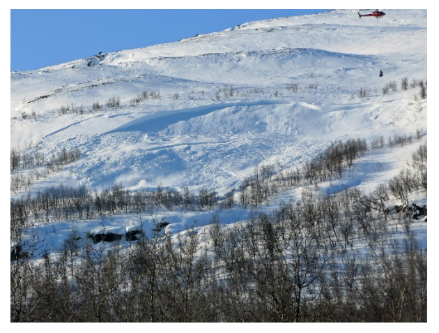
Fig. 2: Avalanche released just above the tree line. Helicopter with DaisyBell can be seen in the upper right corner.