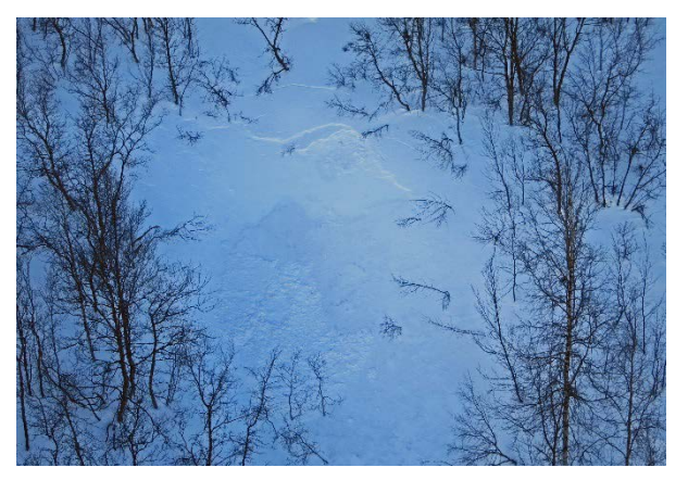
Fig. 1: Example of a result of DaisyBell explosion in a pocket inside birch forest. Only very small, near surface avalanches were released.

In the more open landscape just above the tree line (only a few trees), several large (size 3) avalanches were triggered by just one DaisyBell shot (Fig. 2). These avalanches involved the weak layers of faceted crystals at different depths, and the crack propagation ability was high. As seen from Fig. 3, the crack propagation was also here to a certain degree limited by trees.