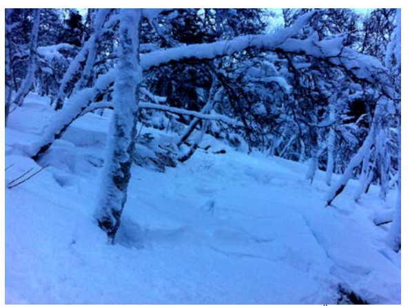
Figure 3. Skier triggered avalanche in Åre, Sweden.

During winter 2013, several skier-triggered avalanches occurred near the ski resort Åre, Sweden, both in open mountain terrain and in forest. They were released due to a weak layer of facets (pers. comm. Mårten Johansson, Åre Avalanche Center). The weak layer was a result of weeks of cold weather after rain. A rain crust worked as a vapour barricade, and a high temperature gradient built a layer of facets below the crust. The avalanches in the birch forest were small avalanches, size 1, according to the Canadian size classification.