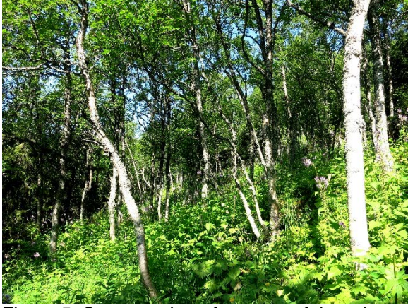
Figure 5. Summer photo from one of the release areas in Åre.