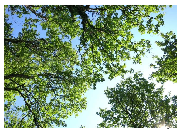
Figure 4. Summer photo from release area in Åre showing crown cover in summer.

Fieldwork during summer 2013 shows that the forest in the release areas was old and tall with tree heights of around 3-5 m (figs. 4 and 5). Few juvenile trees and shrubs were found. The forest showed little signs of damage from creep and avalanches.