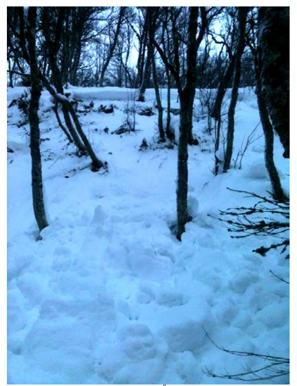
Figure 2. Avalanche in Åre, Sweden, around New Year 2012.

We have especially studied two cases of skier-triggered avalanches released in birch forest in Åre, Sweden (figs. 2 and 3). Information (snowpack, gps-position and photos) on these avalanches were provided by Åre Avalanche Center and the release areas visited the following summer.