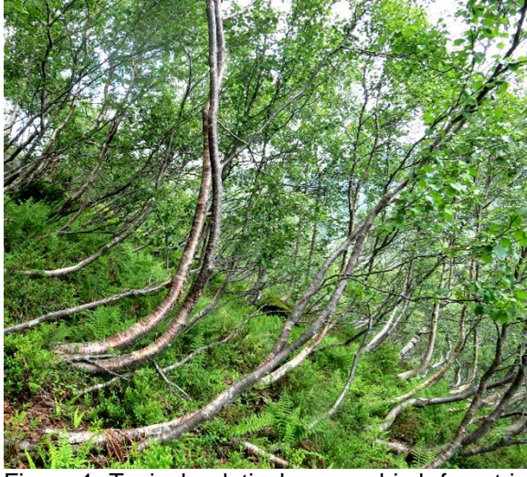
Figure 1. Typical, relatively young birch forest in Hornindal with stems affected by snow movement.

avalanches some birch trees show few or little damages, but according to Lied and Kristensen (2003) most birch forests will die if the avalanche frequency is higher than about 4 years.